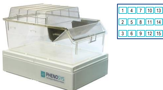
PhenoSys Activity Monitor with 5x3 RFID-reader matrix.

A PhenoSys RFID-based Activity Monitor was placed underneath a standard Type IV cage to automatically record individual activity of group-housed rats. The Activity Monitor consists of 15 RFID-readers that cover the entire ground area of the cage.